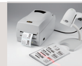
> Standalone mode with scanner