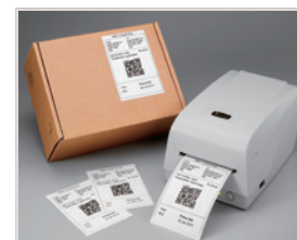
> Cutter mode

The OS-314plus desktop barcode printer offers advanced functions and features in an attractive, space-saving design. A 300dpi thermal transfer printer, the OS-314plus provides up to 4ips print speed and multiple interfaces for meeting low-to-mid volume printing demands, and also supports PPLA/PPLB emulations. New features include a more secure, yet easy-to-open cover lock and saw tooth and blade tear-off bars for both thick and thin paper. This printer is perfect for applications such as 2D barcode labels, apparel labels, and jewelry labels printing, and its top cover also detached to support use in kiosks and other special applications. Standalone applications require only an optional scanner. Other printer options include a cutter, an RTC, and an 8-inch OD stacker, and a 4M Asian Font Card. The new OS-314plus delivers enhanced features, excellent performance, and out-standing value.